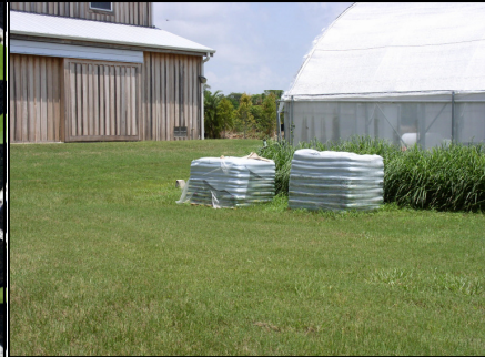
Potting Soil for Seedlings